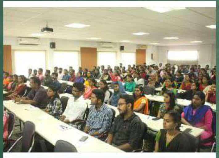
THE OVERWHELMING CROWD