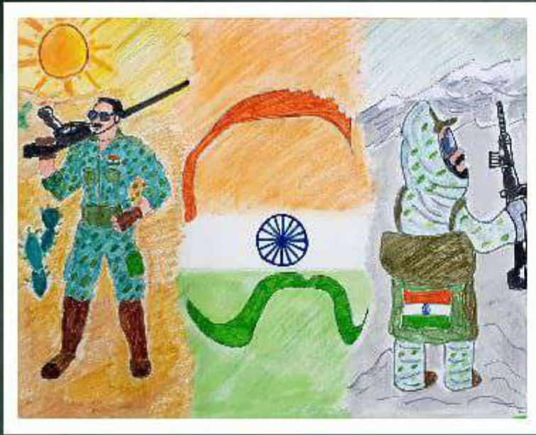
Siva Subramaniam CA INTERMEDIATE