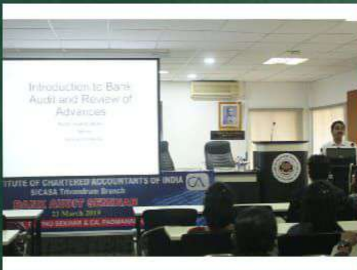
CA GOVIND SHEKAR SIR'S MORNING SESSION