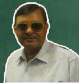
About the Author