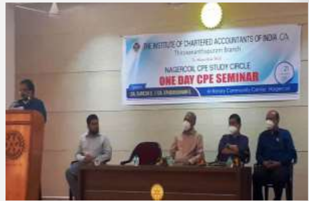
INAUGURATION OF GOLDEN JUBILEE CELEBRATIONS OF THIRUVANANTHAPURAM BRANCH OF ICAI