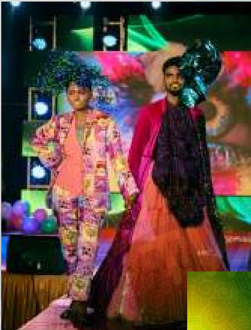
• Fashion Show