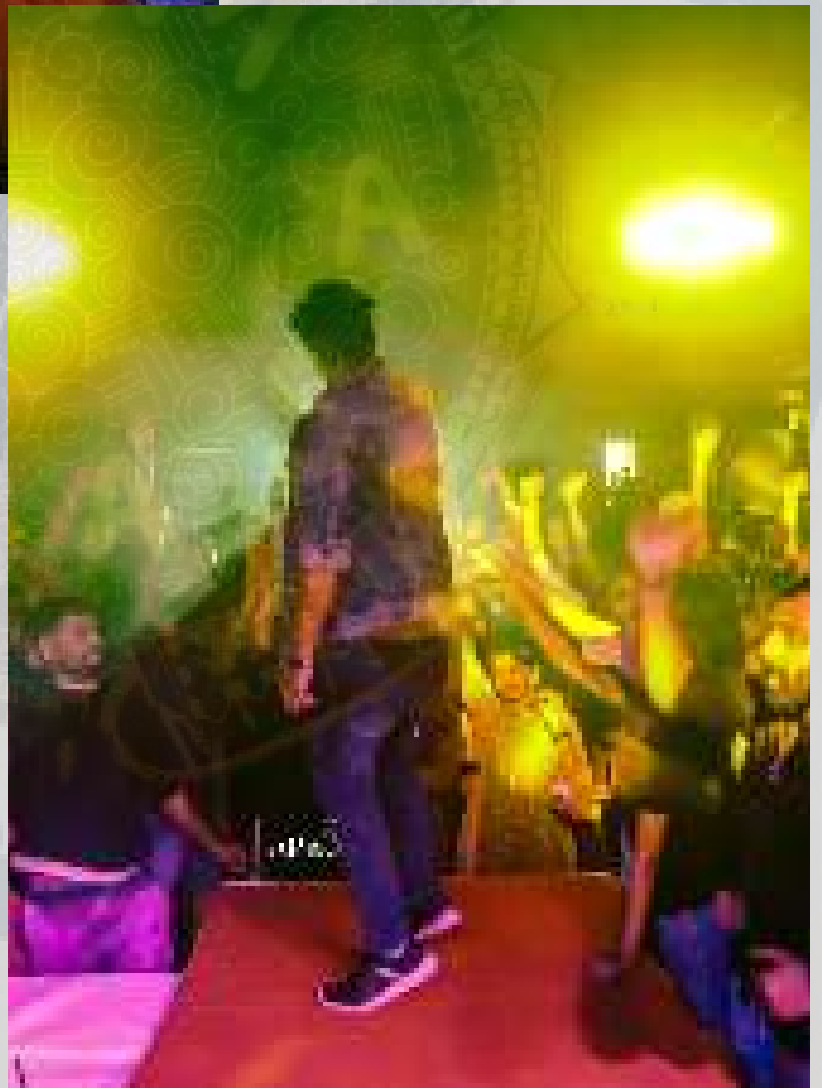
• Band Performance