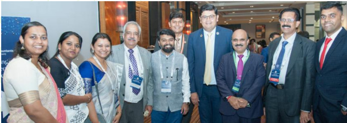
with President of ICAI