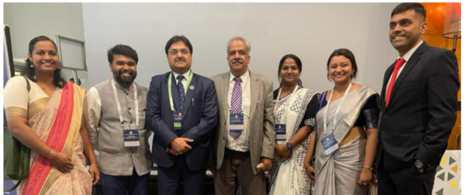
with SIRC TEAM of ICAI