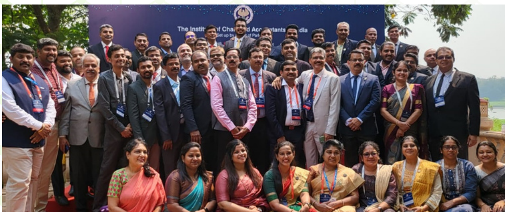
Orientation Programme for the Managing Committee at Mumbai