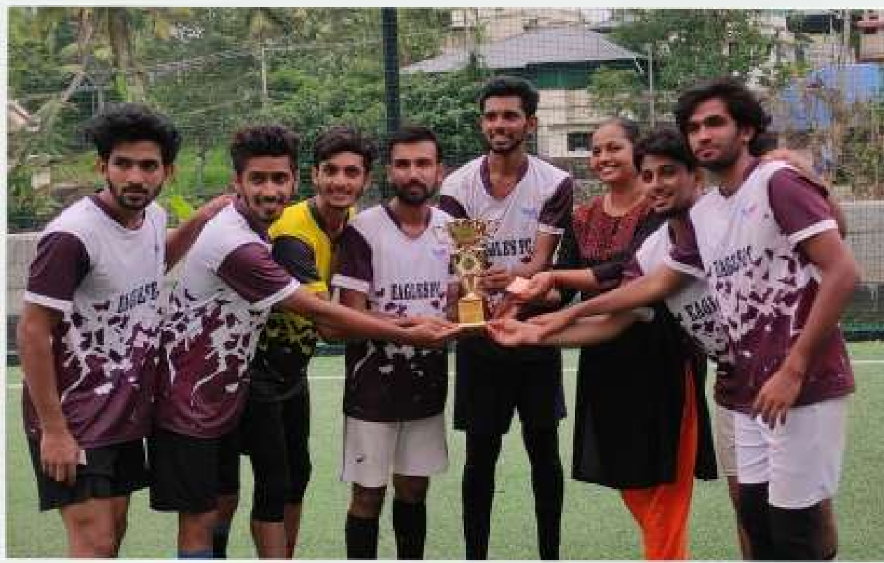
WINNERS : EAGLES FC