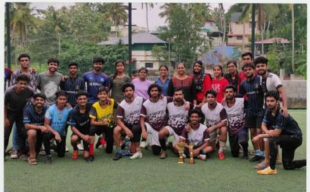
RUNNERS UP: LAKSHIYANS FC