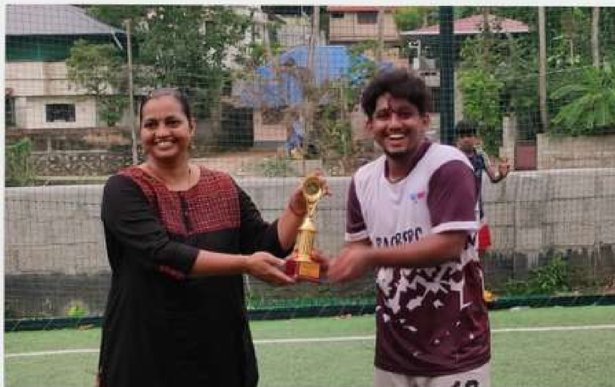
BEST PLAYER : IJAS