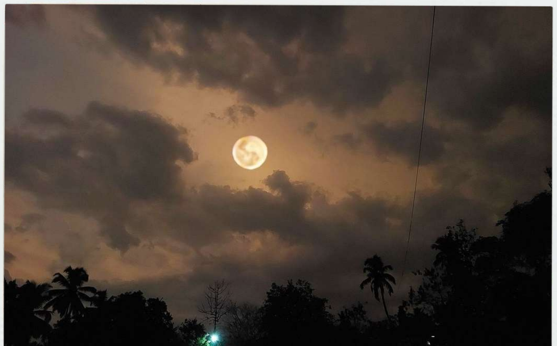
Ajmal - SRO 0700062