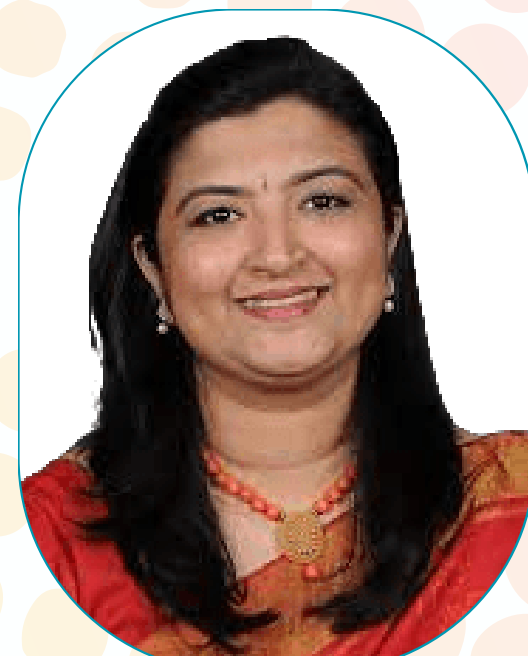
CA. Sripriya Kumar

HON. MINISTER OF STATE FOR EXTERNAL AFFAIRS GOVT OF KERALA