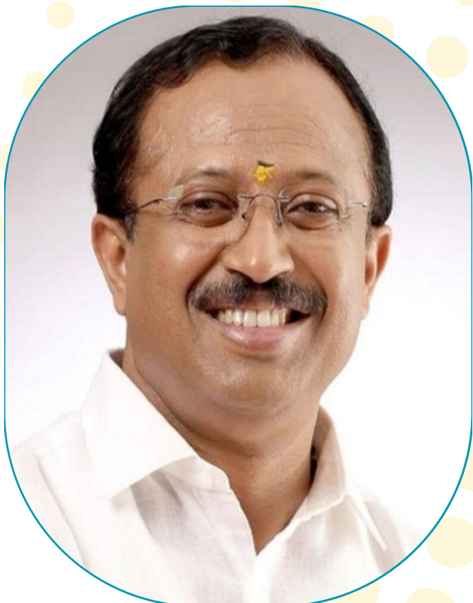
Shri. V. Muraleedharan

HON. MINISTER OF STATE FOR EXTERNAL AFFAIRS GOVT OF KERALA