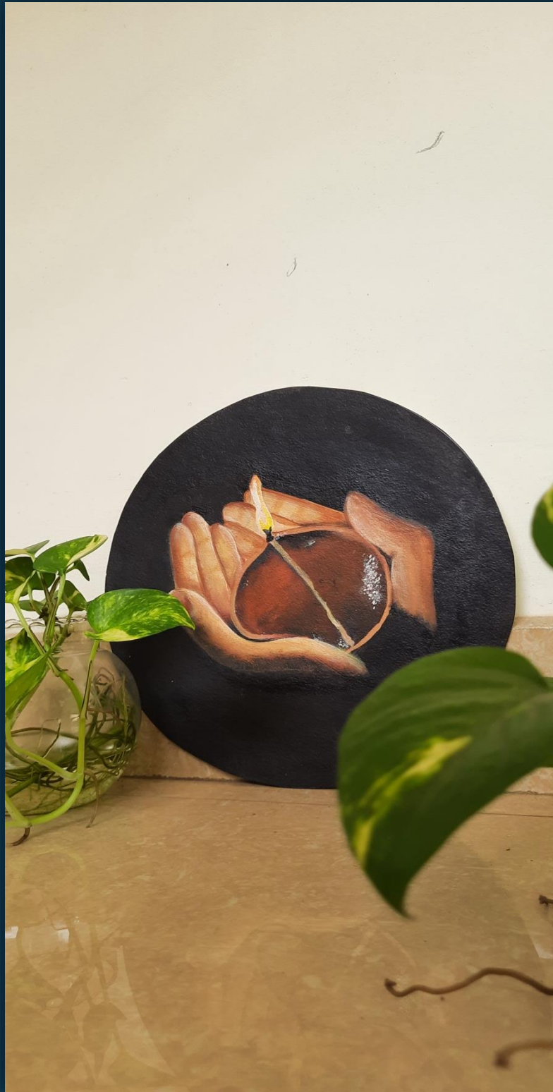
-AMMU KRISHNA -SRO0776006